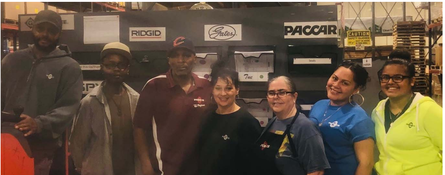
Pictured below: the hard-working Procurement team!