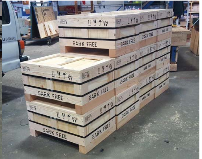
Above and below: high tech!!