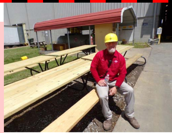
"Ask and you shall Receive"