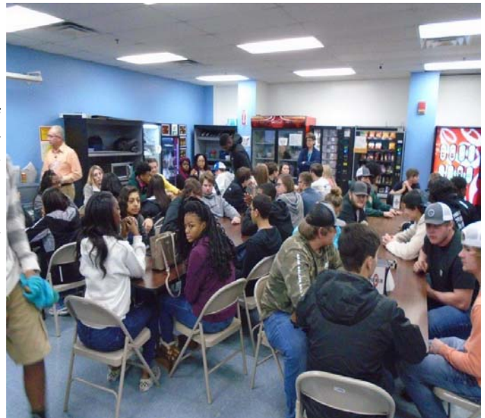
Juniors & Seniors from Halls High School

the safety railings after being told about the different area work departments. This elite group of teenagers elected to visit local industry in hopes of making decisions on career choices. Many admitted they were not on the "college pathway" and interested in "vocational/technical" career opportunities. Well-mannered and very respectful, both groups seemed to enjoy the opportunity to visit Pierce Distribution and learn about the skills and work ethics expected to make them successful future associates. Pierce appreciates the Lauderdale County Board of Education and especially leaders from Halls High School in coordinating this educational and successful event.