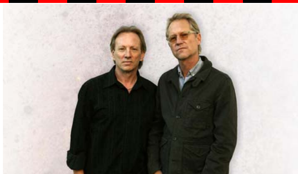
America. (from America's Facebook page)