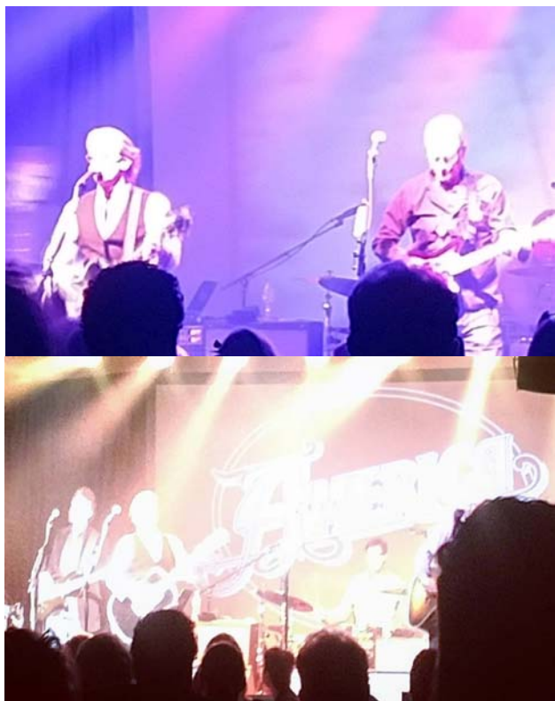
America performing at Giovanni's April 30