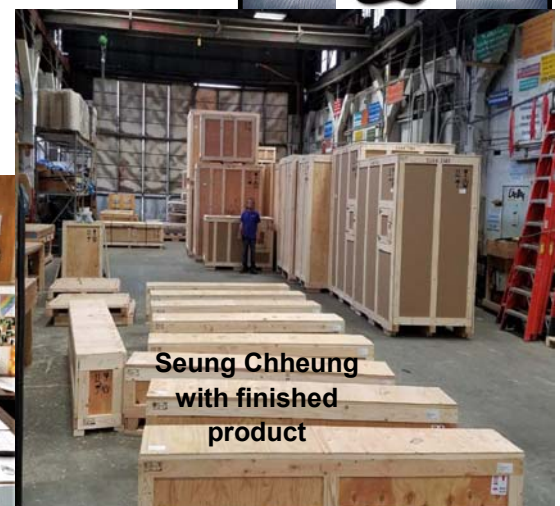
Seung Chheung with finished product